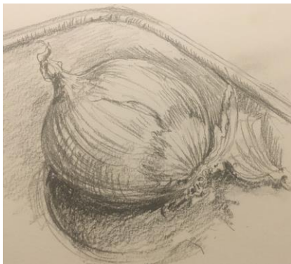
4) Spherical fruit and veg