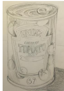
5) A can for drink or food